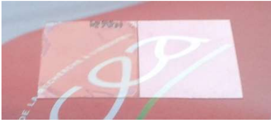
Figure 1 : Picture of polycarbonate substrate with moth-eye structure (on the left) and without any antireflective treatment (on the right) – Antireflective moth-eye structure improves transmission through PC substrate.