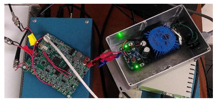
Figure 3: A top-down image of the custom-built PCB and power supply for the new STEM scanner.