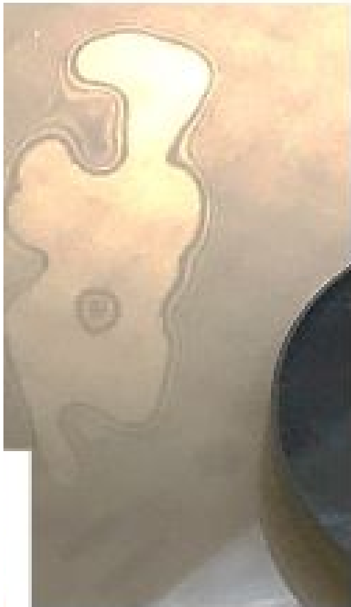
Fig. 1 Nanocontacting Lithium Tantalate (Grey)