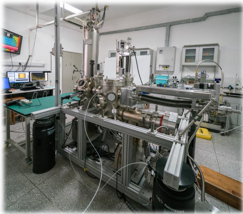
Fig. 2 Photo of the home-made UHV-LT -SPM-MBE system