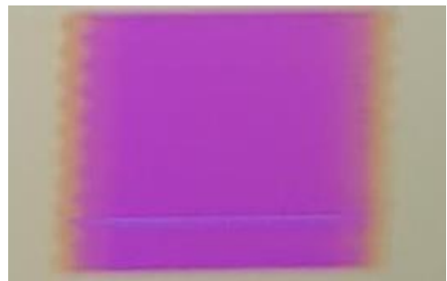
Figure 4 ZnO lines printed with minimal spacing