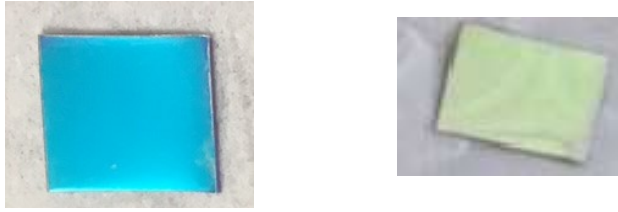
Figure-1: Examples of colors achievable by coating aluminum with Al 2 O 3 and TiO 2 .